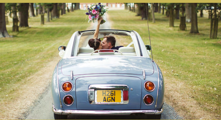
Photo credits: Ami Robertson, Big Fish Photography, D&A Photography Event Images: Trigger Air, Harpur Garden Images, Ellen Rooney, Lindsay Saunders, Wild Carrot Photography, Beckie Egan Photography